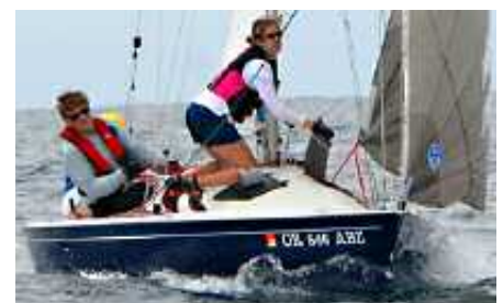
Q, what else is necessary to say?