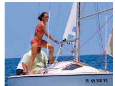
Giddy Up getting ready to hoist.