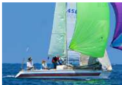
Guanno Happens skipper on borrowed boat.