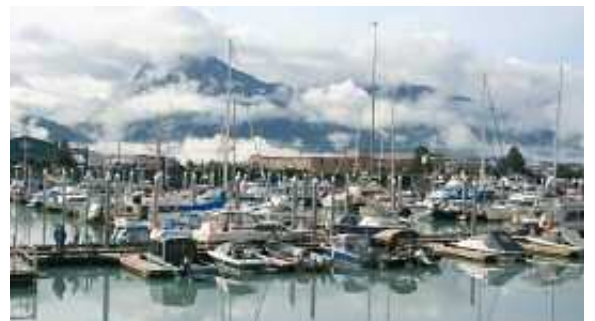
Port of Valdez, Alaska